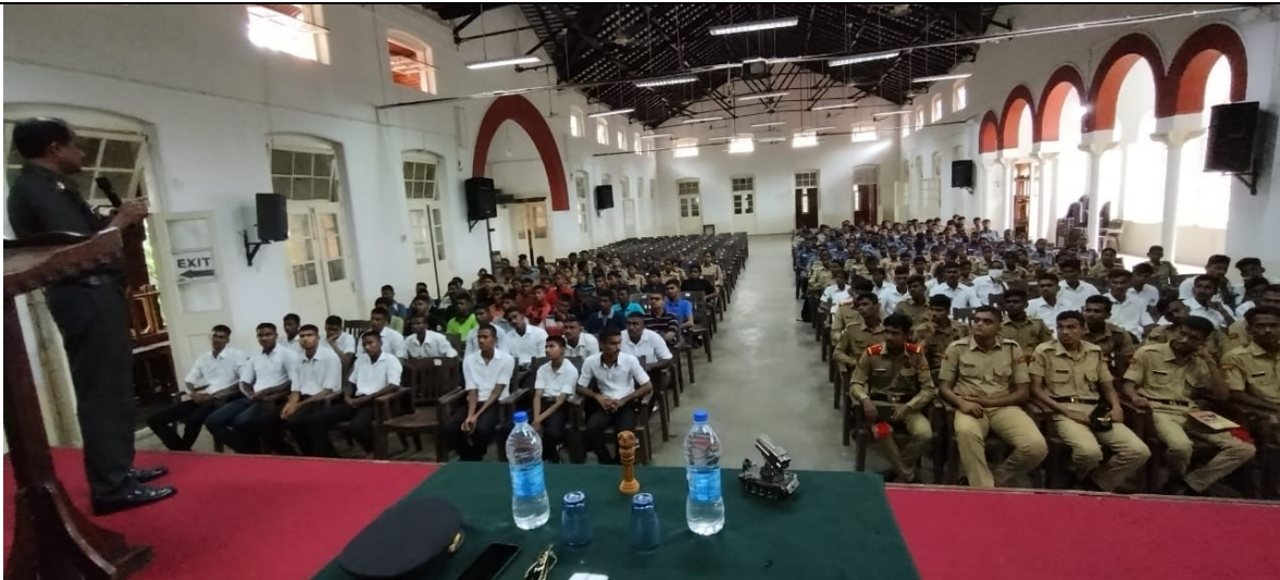
Commanding officer of 28 (TN) BN NCC, Virudhunagar delivered talk