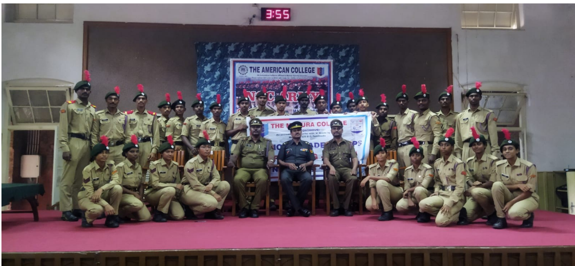
Group photo of NCC cadets of The Madura College with Commanding officer of 28 (TN) BN NCC, Virudhunagar