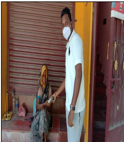
NSS Volunteers of Madura College distributing food to strangers during CORONA Lockdown.