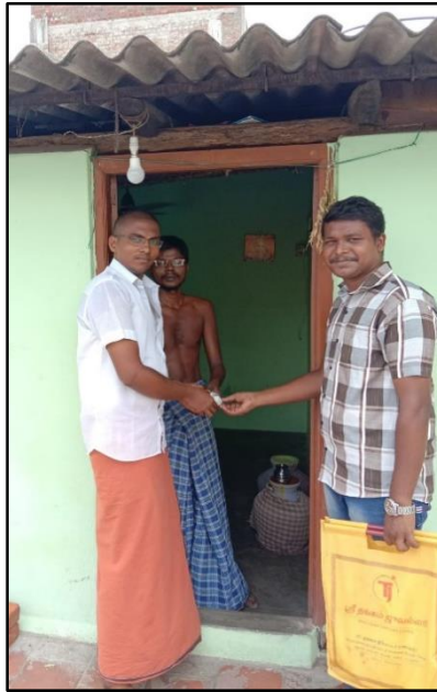
NSS Volunteers of Madura College distributing Tablets (Orsanic album) to people during CORONA Lockdown.