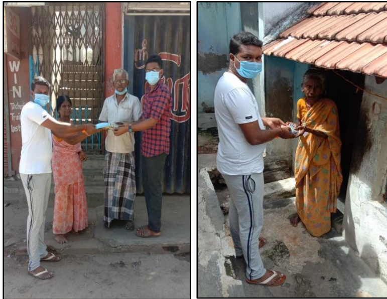
NSS Volunteers of Madura College distributing Masks to people during CORONA Lockdown.