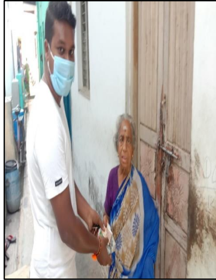
NSS Volunteers of Madura College distributing Grocery things to people during CORONA Lockdown.