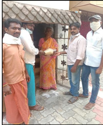
NSS Volunteers of Madura College distributing rice to people during CORONA Lockdown.