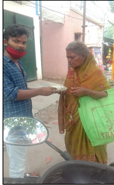
NSS Volunteers of Madura College distributing food to strangers during CORONA Lockdown.