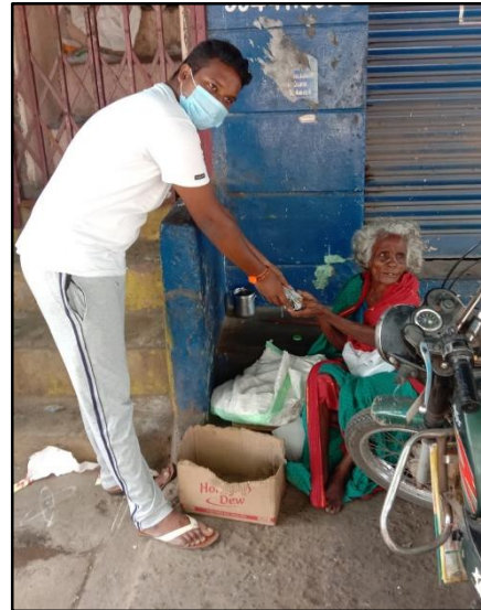
NSS Volunteers of Madura College distributing Masks to people during CORONA Lockdown.