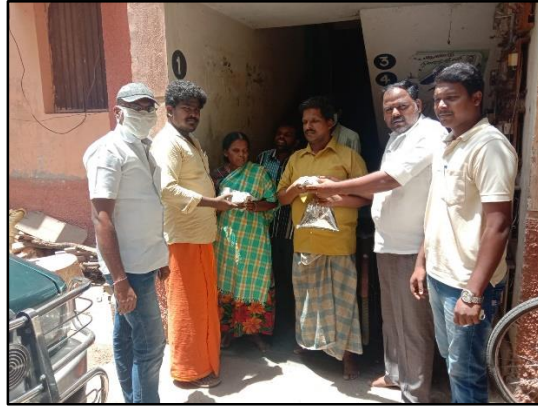
NSS Volunteers of Madura College distributing Grocery things to people during CORONA Lockdown.