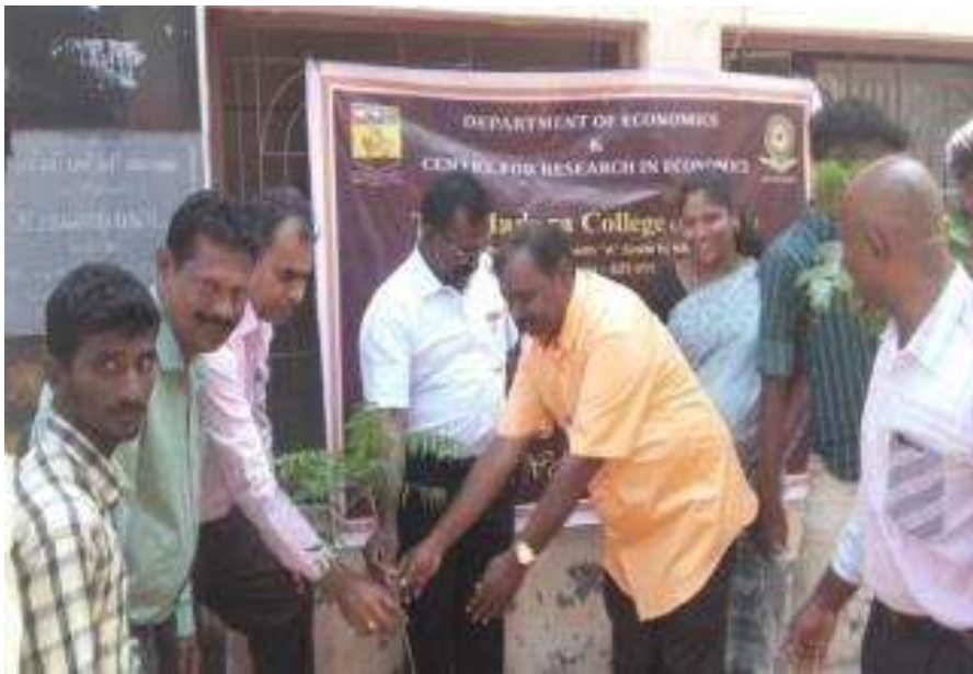
Head of the Department

Environmental Awareness Campaign held at Madurai Corporation Higher Secondary School, Sundararajapuram, Madurai-11. Planting tree sapling on 18.01.2018 as a part of Extension Activity of the Department of Economics.