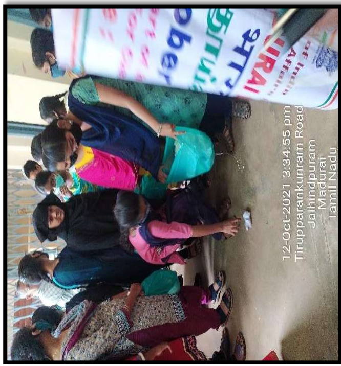
12-Oct-2021 3:34:55 pm Tirupparankunram Road Jaihindpuram Madurai Tamil Nadu