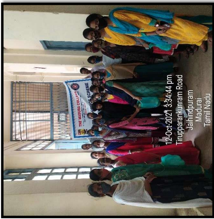
12-Oct-2021 3:34:44 pm Tirupparankunram Road Jaihindpuram Madurai Tamil Nadu