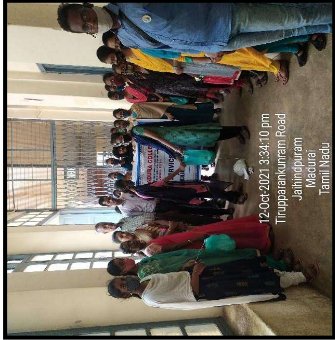
12-Oct-2021 3:34:10 pm Tirupparankunram Road Jaihindpuram Madurai Tamil Nadu