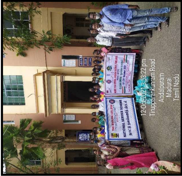
12-Oct-2021 3:53:22 pm Tirupparankunram Road Andalapuram Madurai Tamil Nadu