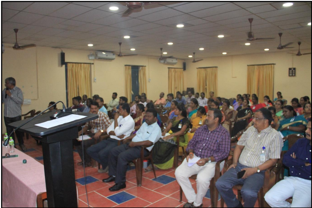
A view on Participants

A handwritten signature in green ink, appearing to be 'J. S.', is positioned above the principal's name.