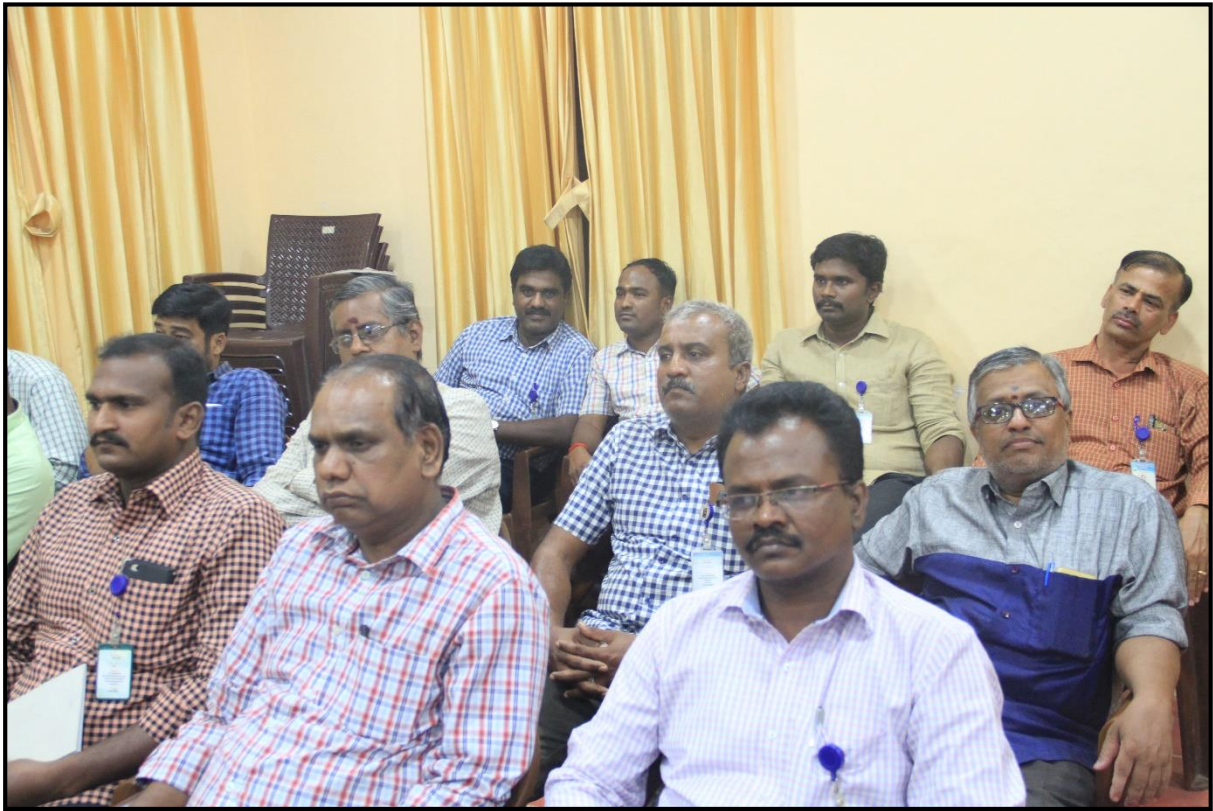
A view on Participants